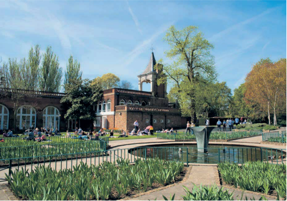
Sunbathers enjoying Holland Park. Inset: Opera Holland Park